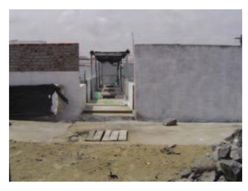
PLATE 8 Shrimp hatchery along the coast in Anumanthai