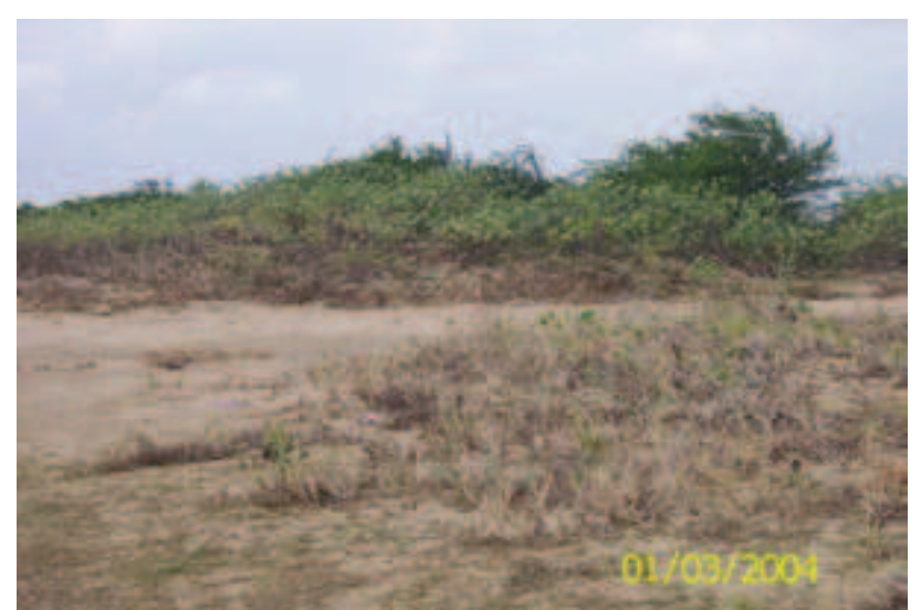
PLATE 23 Sand dunes in Valmikimedu