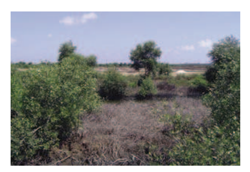
PLATE 3 Mangrove forests have been steadily cleared to establish salt pans. A view of a degraded mangrove forest that will eventually give way to salt pans