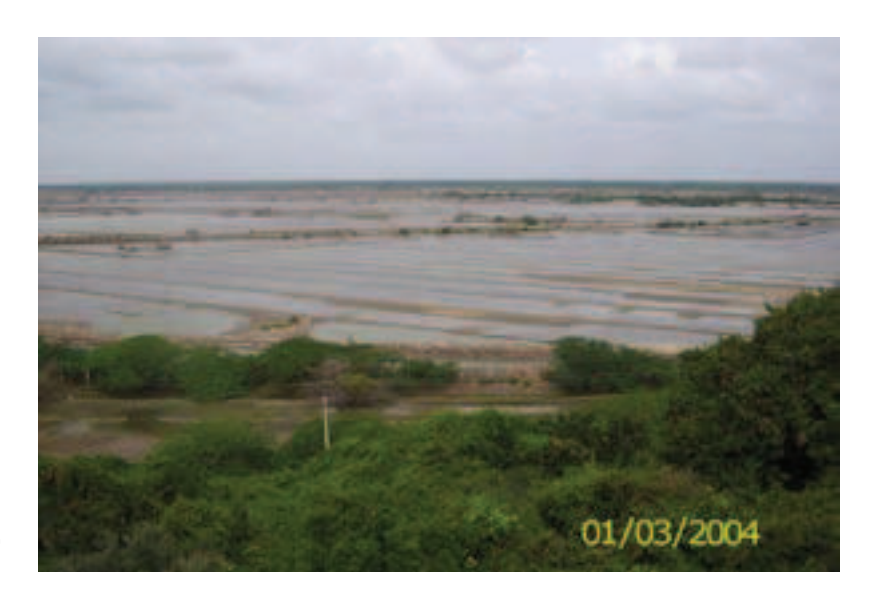
PLATE 16 Salt pans in Tanjavur district