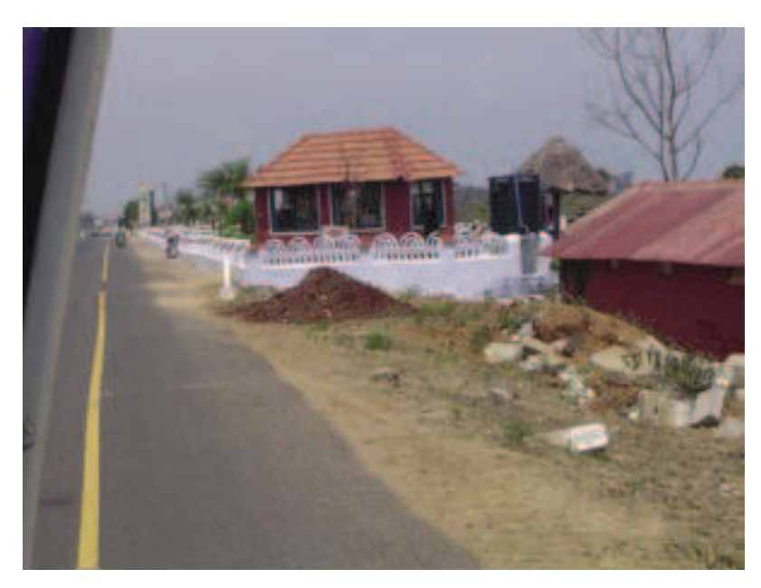
PLATE 21 Wayside amenities constructed by Tourism Department on ECR - Kancheepuram