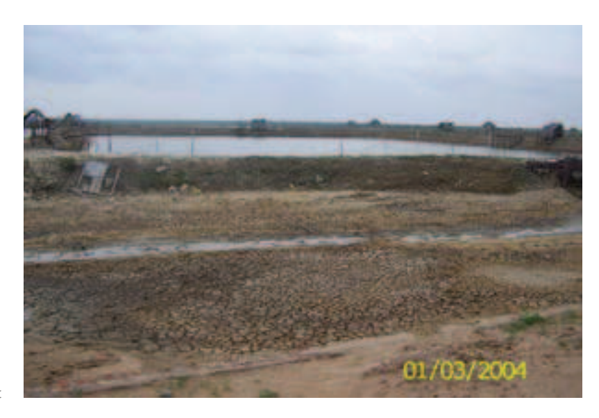
PLATE 17 Aquafarms in Pudukottai district