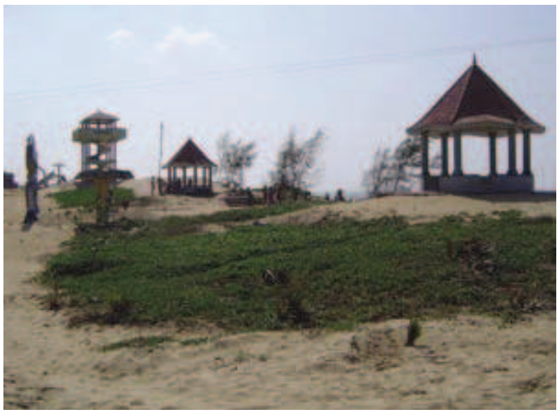
PLATE 20 Sand dunes leveled for tourism; Sothavilai, Kanyakumari