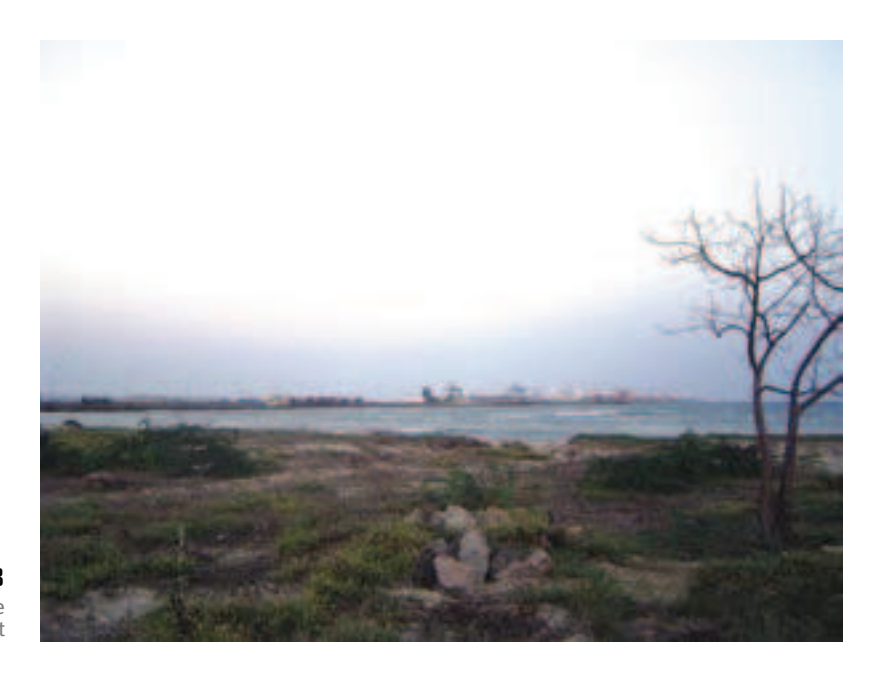
PLATE 18 Industrial expansion along the Thootukudi coast