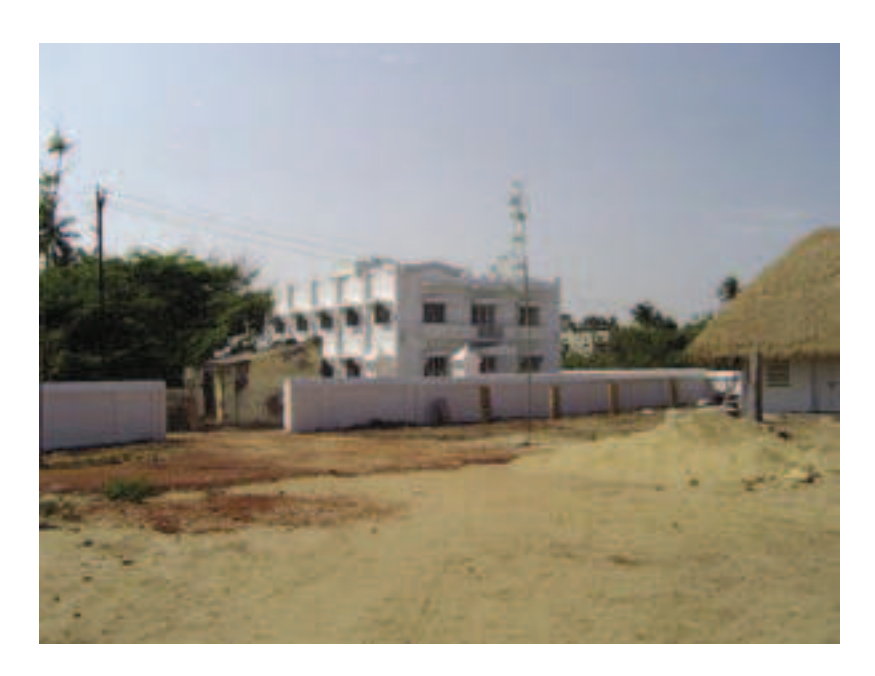
PLATE 14 Extension of dormitory of the bungalow, Tarangambadi