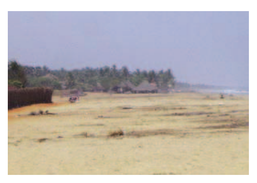
PLATE 9 Auroville Beach, Pondicherry - numerous tourism structures can be seen here