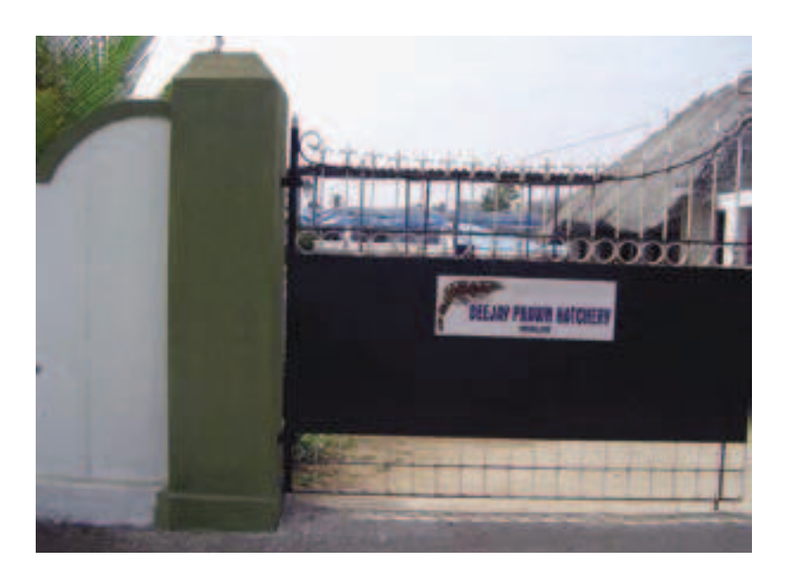
PLATE 7 A view of Deejay Hatcheries at Kovalam within 100 m of the High Tide Line (HTL)