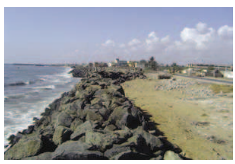
PLATE 2 Sea wall along the road, north of Chennai