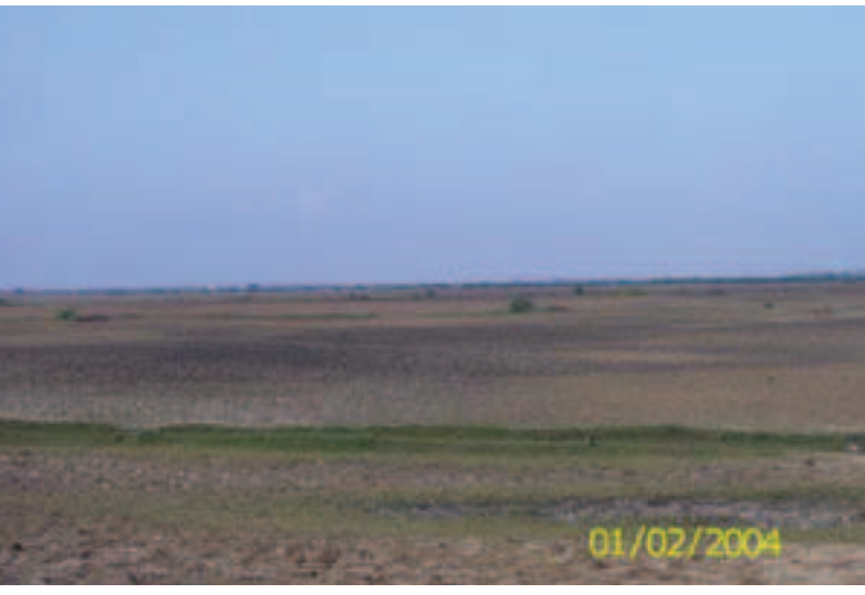
PLATE 15 Agriculture lands in Thiruvarur district affected due to aquaculture