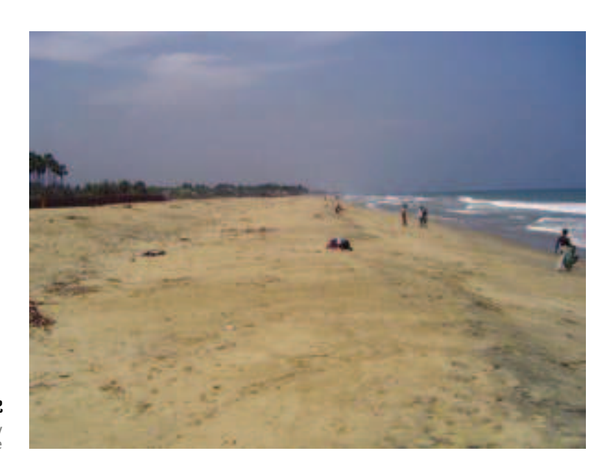
PLATE 22 Auroville beach in Pondicherry – many temporary structures can be seen here