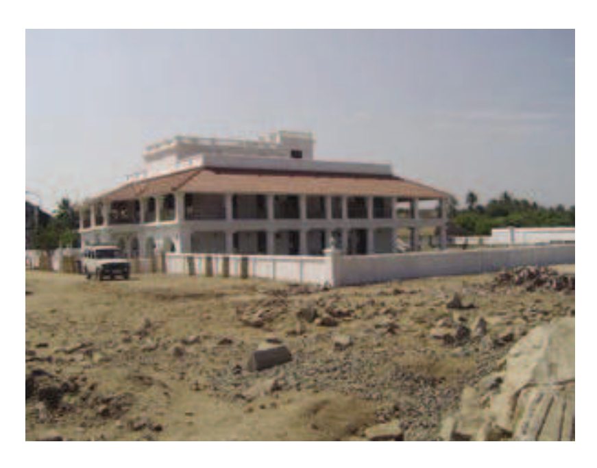
PLATE 13 'Bungalow on the Beach' hotel in Tarangambadi