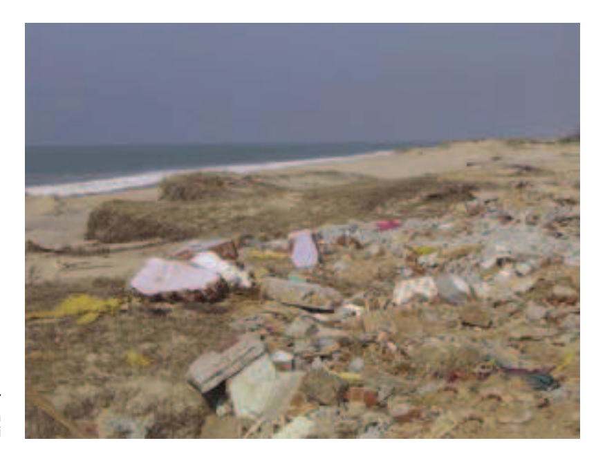
PLATE 24 Rubble dumped on the coastal areas in Kanyakumari