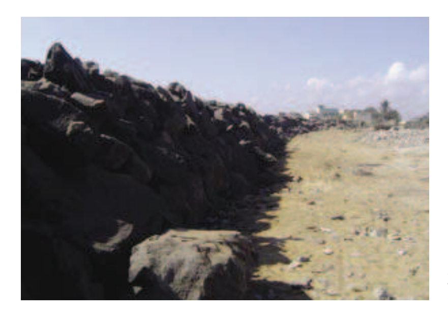
PLATE 1 Boulder wall opposite to the Coromandel Cement Factory at Ennore. The boulder wall on an average is 3.3m in height and 2.3m in width