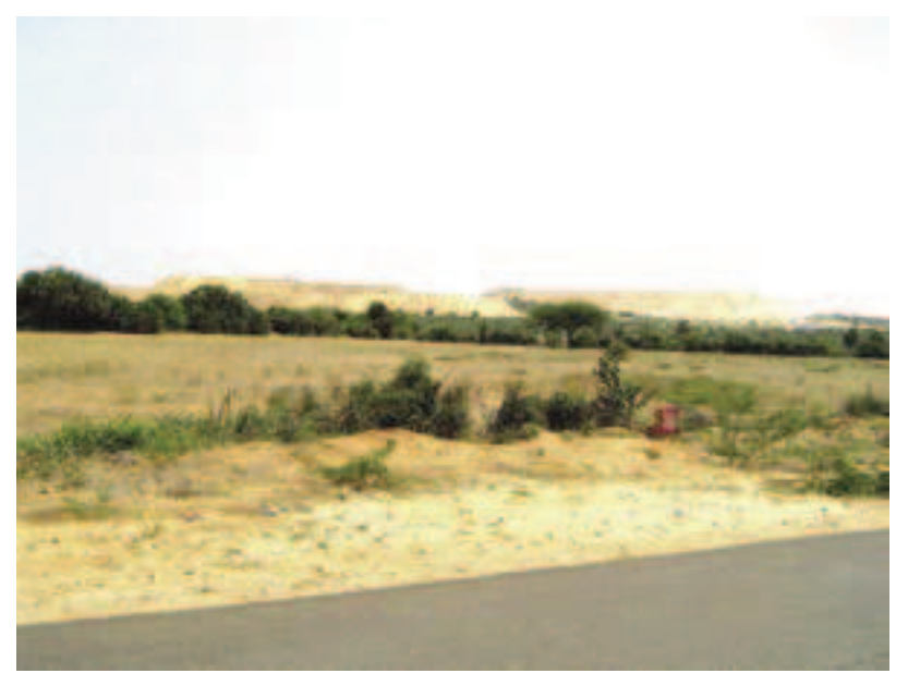
PLATE 19 Mining for rare earth in Tirunelveli coast