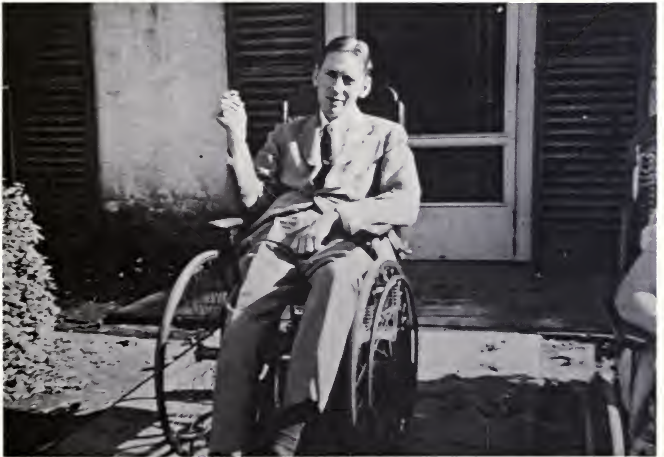
Recuperating at Warm Springs Foundation, Georgia, December 1944.