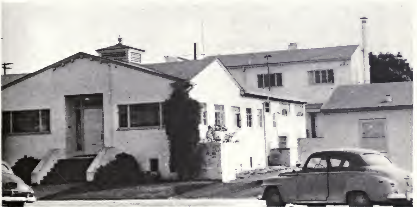
The Acton Street Laboratory, California Department of Public Health, 1955.